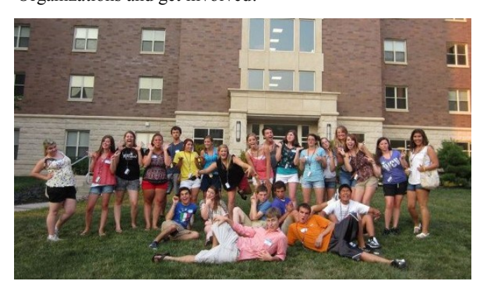
Welcome HC XIV!

You can also find academic-based organizations in every subject, as well as clubs for pretty much any sport imaginable. For a complete list of West Chester University's student organizations please visit http://wcu.orgsync.com/ Organizations and get involved!