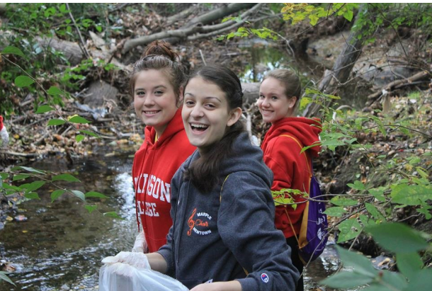
International Coastal Cleanup 2013

Fall Clean-Up at The Hickman. On Saturday, November 9<sup>th</sup>