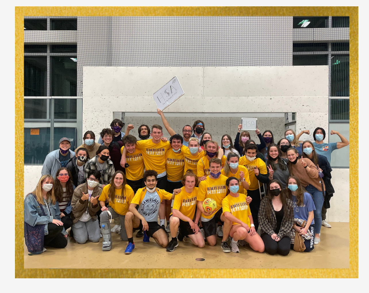
HSA intramural soccer team wins championship game (Spring '22)