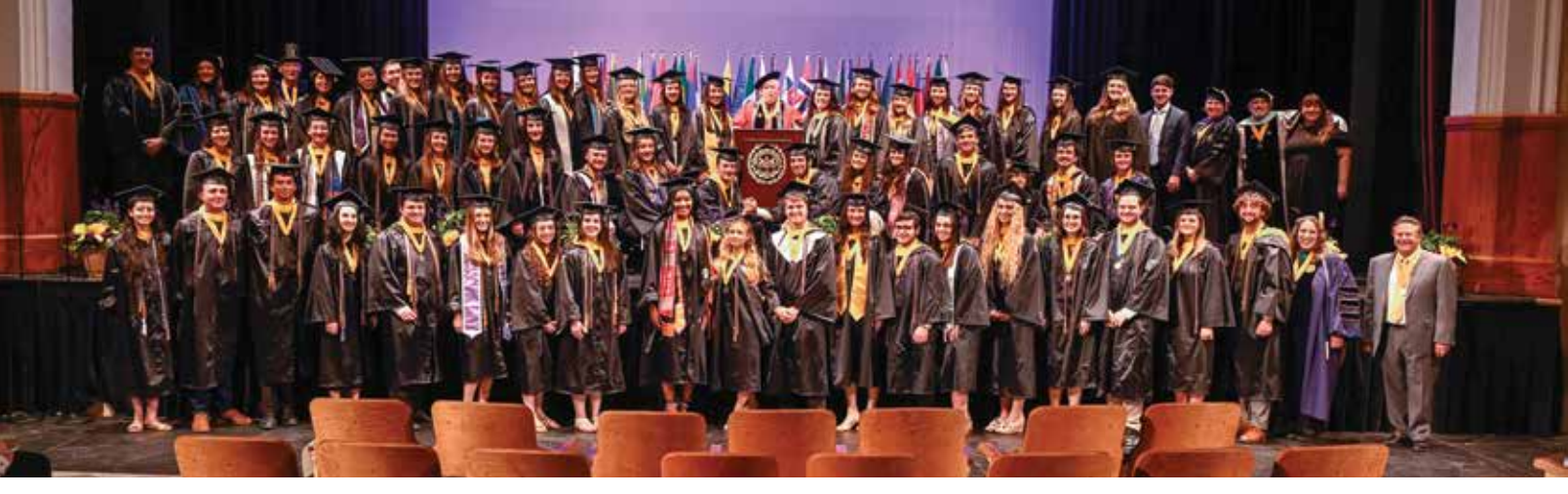
Honors College commencement, May 2022