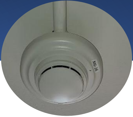
Typical Suite Smoke Detector