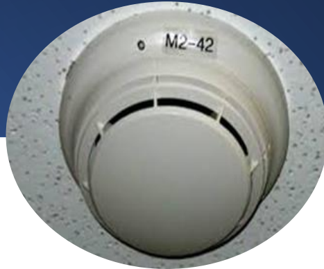
Typical Building Fire Alarm Smoke Detector