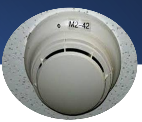
Typical Building Fire Alarm Smoke Detector