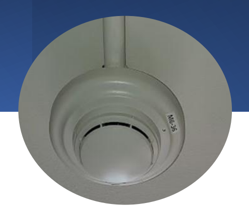
Typical Suite Smoke Detector